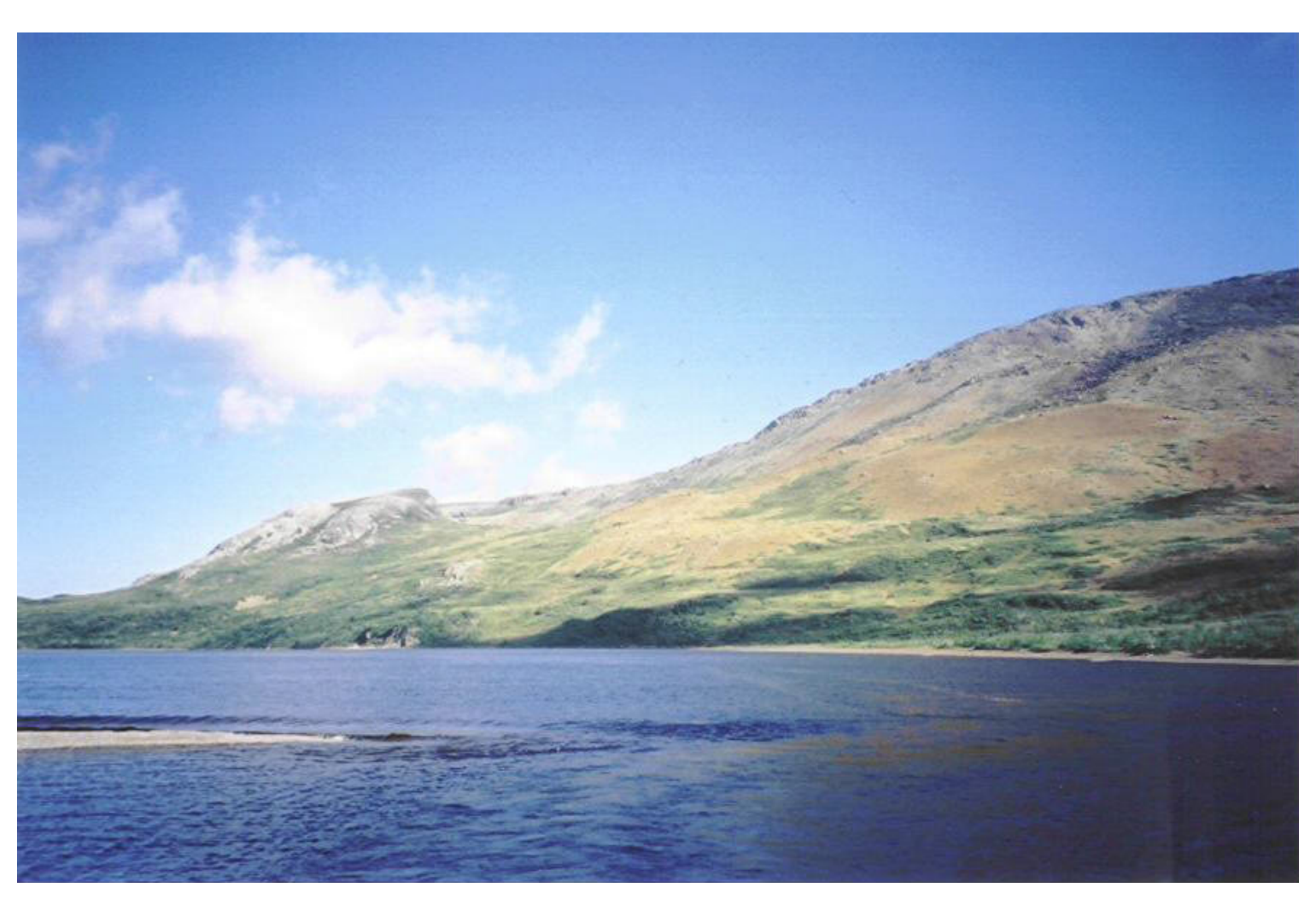
DAY 3 - Sunday, July 7, 2024 Gros Morne National Park

Our journey today takes us into Gros Morne National Park, a UNESCO World Heritage Site, which encompasses almost 700 square miles in the Long Range Mountains on Newfoundland's western coast. The park is home to some of the province's most beautiful scenery. Wildlife,