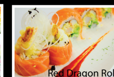
Red Dragon Roll